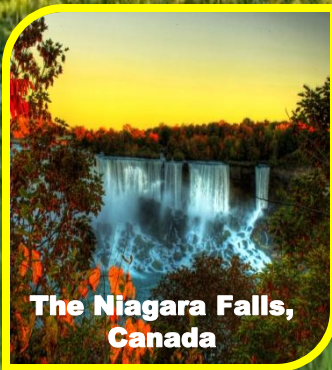
The Niagara Falls, Canada

This is a lake of salty water which you can float in. On the beach , there is a special kind of mud which people put on their bodies!