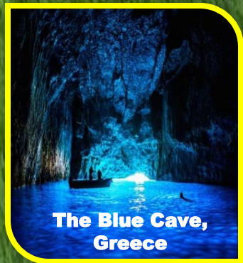
The Blue Cave, Greece

At Niagara there are three different waterfalls . About 5 million litres of water go through them every second!