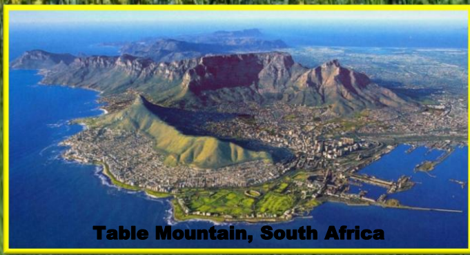
Table Mountain, South Africa