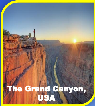
The Grand Canyon, USA