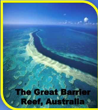
The Great Barrier Reef, Australia